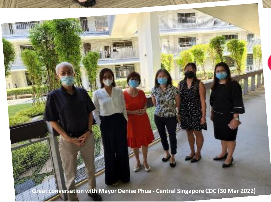
Great conversation with Mayor Denise Phua - Central Singapore CDC (30 Mar 2022)