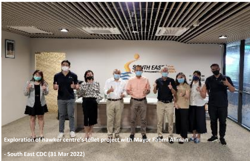
Exploration of hawker centre's toilet project with Mayor Fahmi Aliman