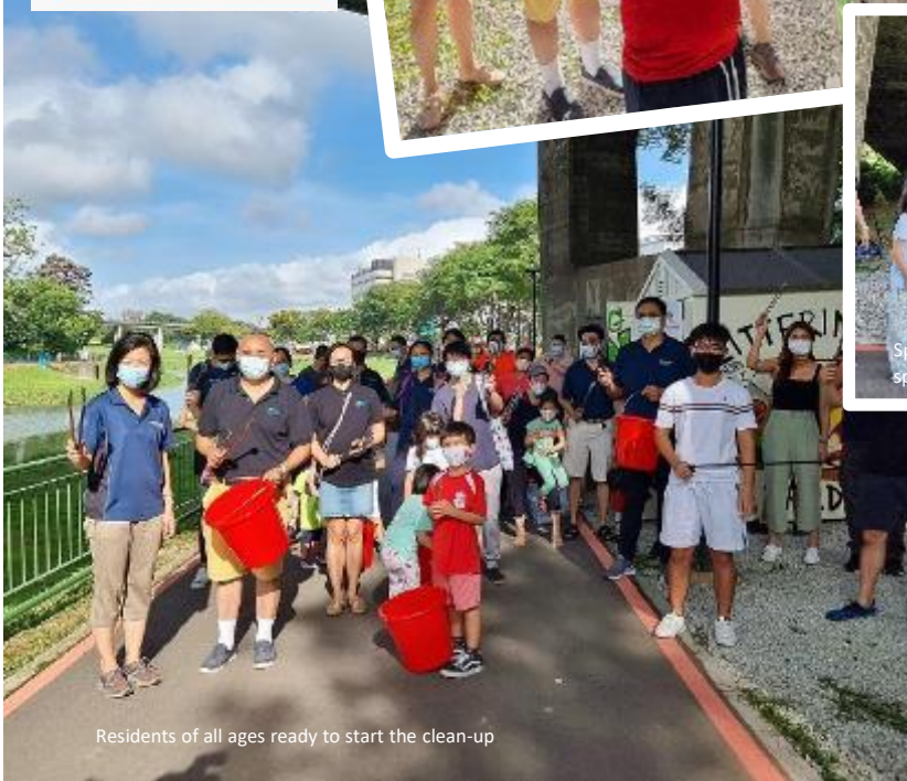
Residents of all ages ready to start the clean-up