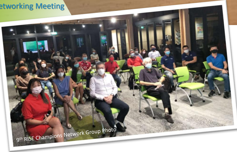
9th RISE Champions Network Group Photo