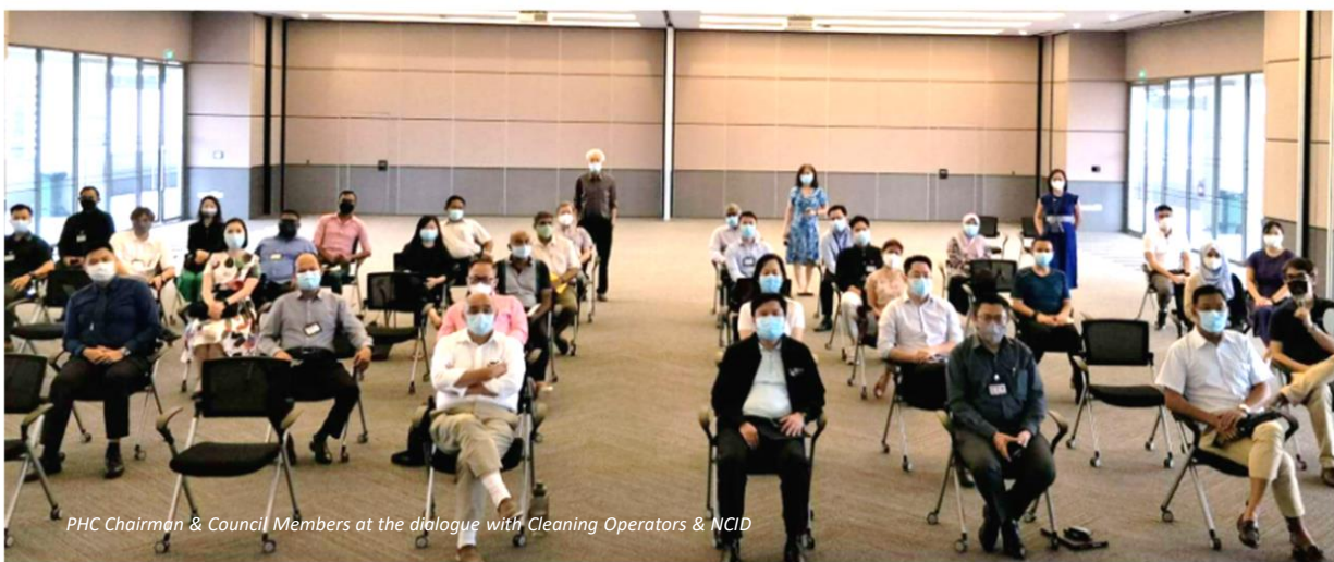
PHC Chairman & Council Members at the dialogue with Cleaning Operators & NCID