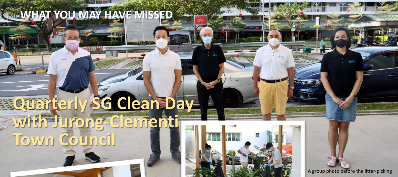
A group photo before the litter-picking