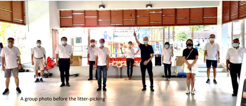
A group photo before the litter-picking