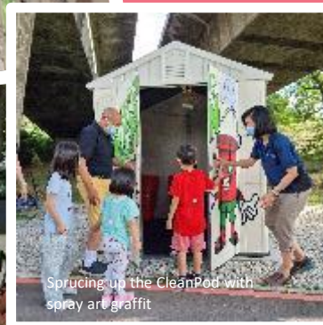
Sprucing up the CleanPod with spray art graffiti